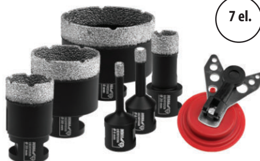
PROWADNIK WIERTEL DRILL GUIDE