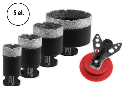
PROWADNIK WIERTEL DRILL GUIDE

VACUUM BRAZED TECHNOLOGIA LUTOWANIA PRÓŻNIOWEGO